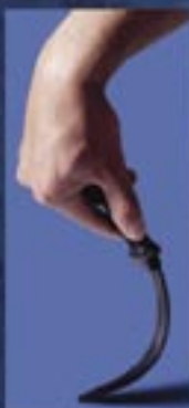
RUBBER TRAINING RECON TANTO (#92R13RT)

RUBBER TRAINING KNIVES SUGG RETAIL: $9.99 EACH SPECIAL PROJECTS: $7.99 EA